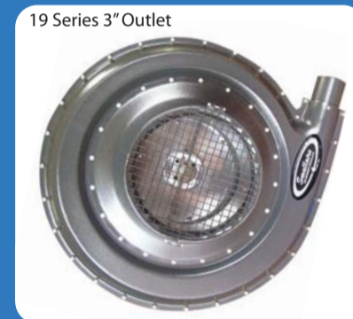
19 Series 3" Outlet