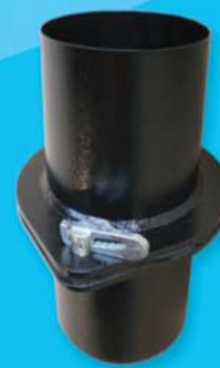
Quick Couple Connector