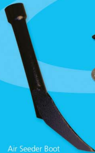
Air Seeder Boot