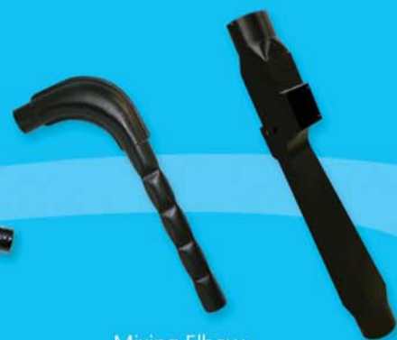
Mixing Elbow with Riser Pipe