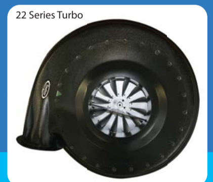
22 Series Turbo