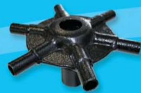
Small Seed Secondary Head