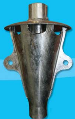
Pressure Relief Vent