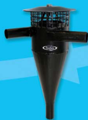
Cyclone Relief Vent