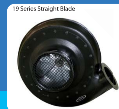
19 Series Straight Blade