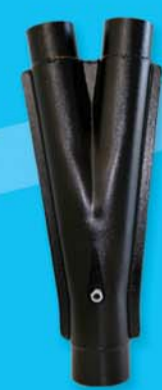
Splitter with Adjustable Vane