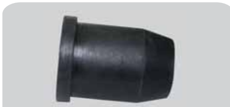
32 mm Rubber Bung

32 mm Rubber Bung Used to blank off outlets